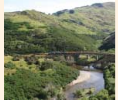
Taieri Gorge Ltd